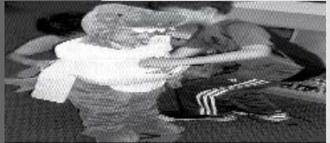
Boy in shark costume: Playing dress up strengthens emotional development.