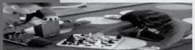
Chess: Chess improves strategic thinking.